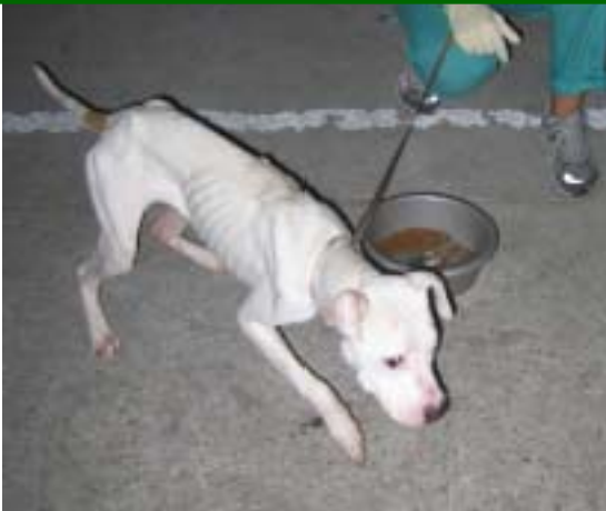
The white pitbull, happy to be rescued

not because of the desolation, as we have all seen that on television, but because of the hope that obviously dwelled in the people there. Even as Hurricane Rita threatened, hundreds of workers continued to sweep the streets of New Orleans of mountains of garbage and debris, erect new street signs, and clear roads. Many of them were smiling, and almost all of them waved as we passed. The military presence in the city was pronounced, and I was amazed at the compassion and tenacity of military, police, fire and rescue personnel in the city. They not only went about the grim task of securing the city and recovering bodies without complaint, they also went out of their way to ensure that the animal rescuers knew right where the animals were. From spray painting notification on the outside of homes, "2 Live Dogs Inside", to writing down addresses to hand to rescuers, to physically picking up animals and bringing them in for help, they made sure that no animal would be left behind. They even went so far as to secure shelter and supplies for animal triage within the city limits, and to take animals with them when our rescuers were at capacity.