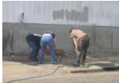
Cleaning the "toxic sludge" off a dog

The aftermath of Hurricane Katrina should teach us many things about the state of our society. It is a lesson in poverty, in preparedness, in grief, and in hope. If the people of New Orleans have half the spirit and tenacity of the animals left behind, the city will not only recover and be rebuilt, but it will flourish.