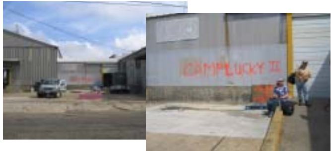
Camp Lucky II, an empty warehouse and day-time holding place for rescued animals, established and supplied by one of the military commanders in New Orleans

When forced to evacuate the animal rescue facility several days early due to the threat of Hurricane Rita, it was with a heavy heart that I returned to Nebraska, wishing for a few more hours with the animals. But the work continues in Louisiana, Mississippi and now Texas, to rescue the animals harmed in the wake of the hurricanes. At last count, over 7,000 dogs, cats and other small animals had been rescued through the Gonzales facility alone.