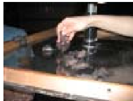
From Left to Right: T. Caldwell digging a post hole, baby bats on the platform, and the platform in the rescue position

babies and still take to the wing safely. Because of the see-through bottom, she could monitor the number of babies on the platform from underneath, without lowering the platform and disturbing the bats on it.