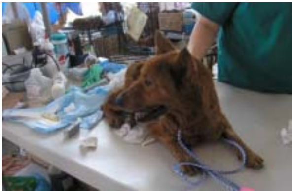
Looking alert after IV fluids and emergency medical care

not because of the desolation, as we have all seen that on television, but because of the hope that obviously dwelled in the people there. Even as Hurricane Rita threatened, hundreds of workers continued to sweep the streets of New Orleans of mountains of garbage and debris, erect new street signs, and clear roads. Many of them were smiling, and almost all of them waved as we passed. The military presence in the city was pronounced, and I was amazed at the compassion and tenacity of military, police, fire and rescue personnel in the city. They not only went about the grim task of securing the city and recovering bodies without complaint, they also went out of their way to ensure that the animal rescuers knew right where the animals were. From spray painting notification on the outside of homes, "2 Live Dogs Inside", to writing down addresses to hand to rescuers, to physically picking up animals and bringing them in for help, they made sure that no animal would be left behind. They even went so far as to secure shelter and supplies for animal triage within the city limits, and to take animals with them when our rescuers were at capacity.