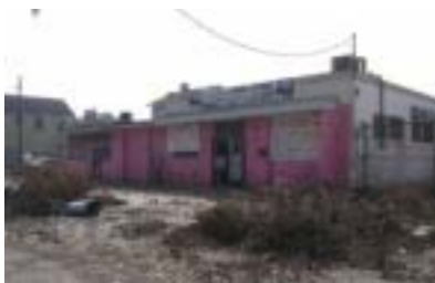
Deserted shop on the edge of the French Quarter

mals, and hundreds of horses from the city of New Orleans. Many of the animals that remained in the city by that time had been without adequate care for almost three weeks. Most of the dogs that arrived each day in the rescue vans and trucks were emaciated and dehydrated. Many of them had chemical burns all over their bodies from swimming through floodwaters contaminated by gasoline, oil, sewage and worse. Hundreds of volunteers worked 24 hours a day to ensure that each animal was cleaned of the "toxic waste" floodwater, re-